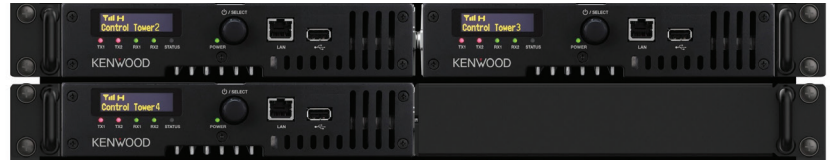
Example of rack mount options.